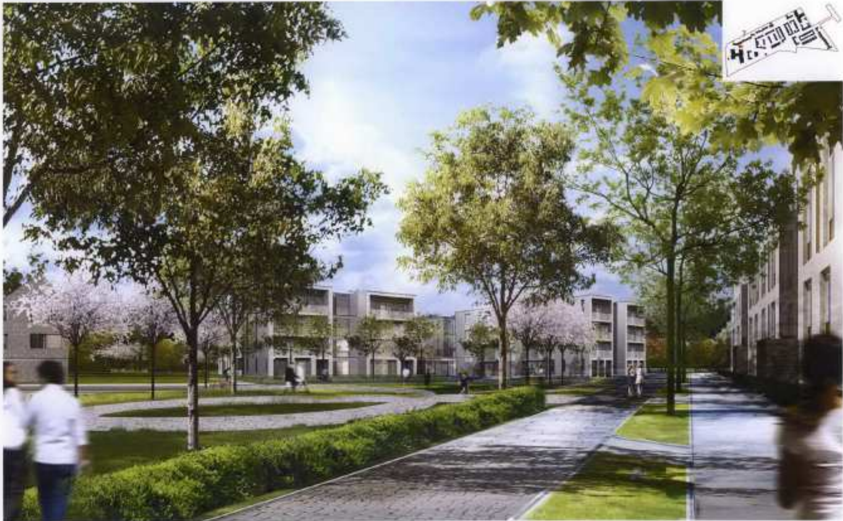
VIEW 7: RETIREMENT LIVING

Design & Access Statement - Final Design Proposal