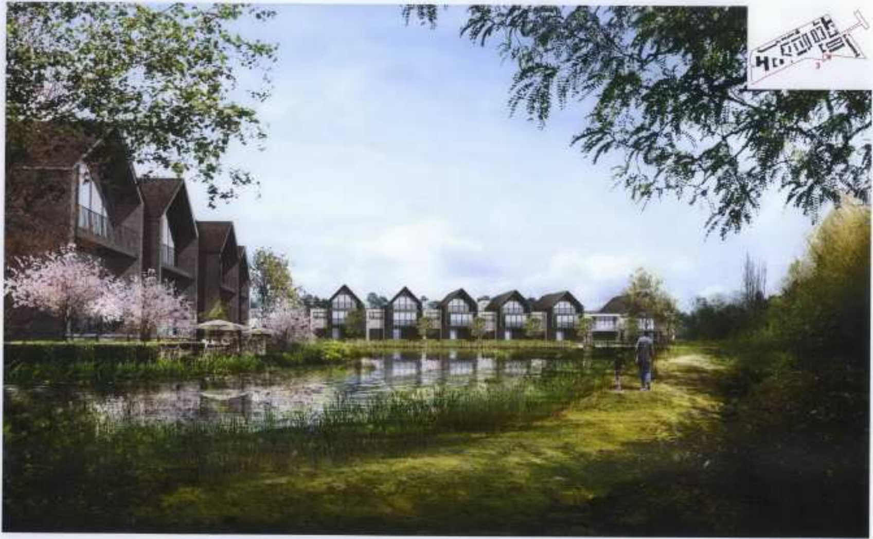
VIEW 3. SSW EAST AT SOUTH-EAST QUARTER

Architectural rendering of a residential development.