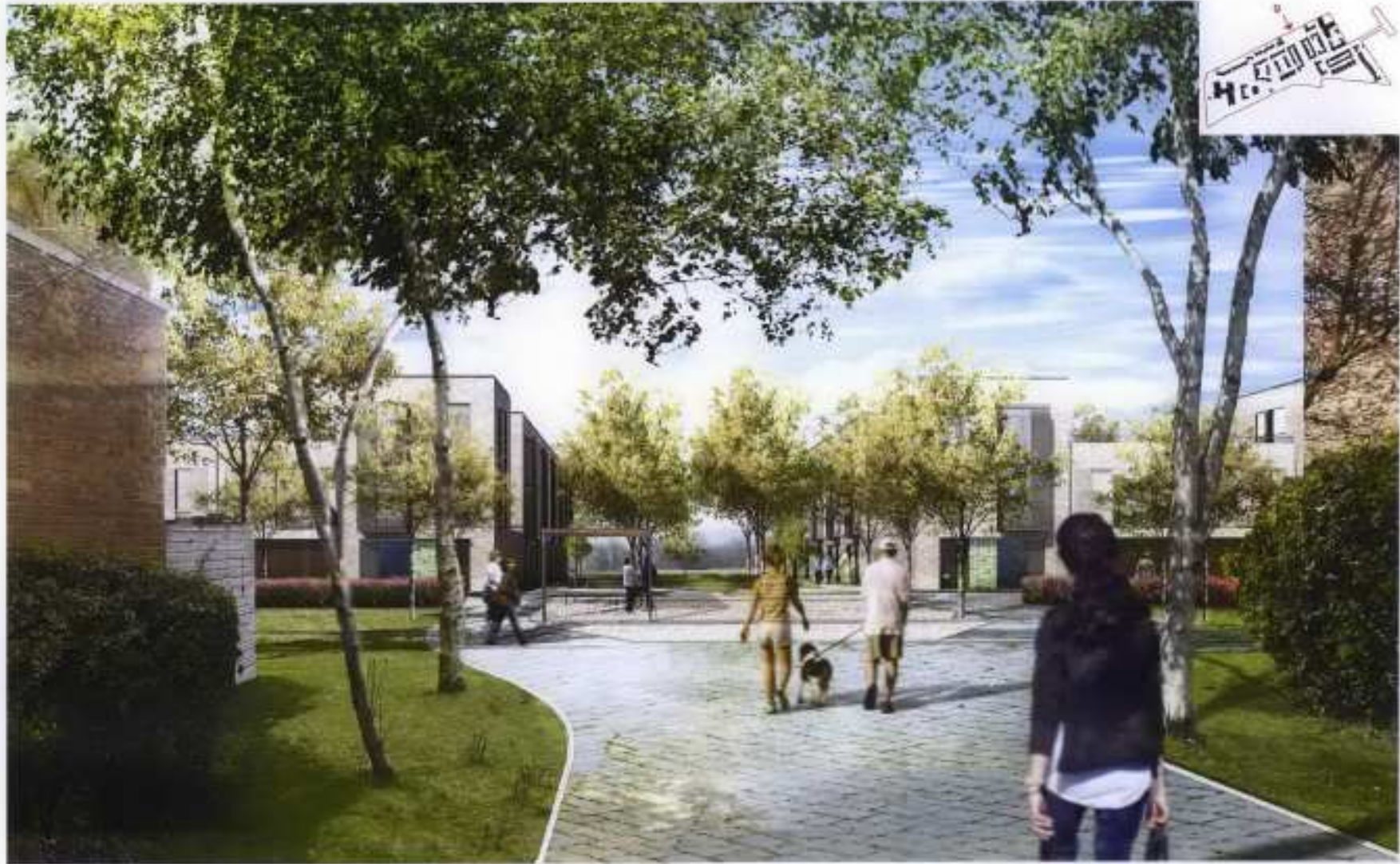
VIEW & VIEW GREENLANDS LOOKING SOUTH

Design & Access Statement - Final Design Proposal