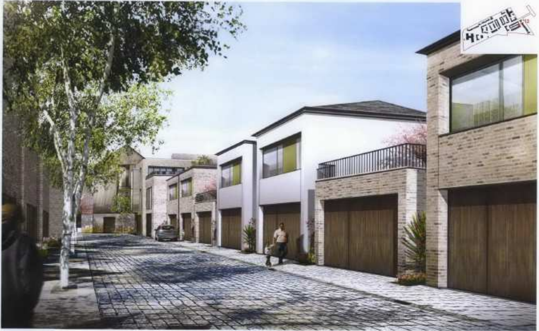
VIEW 11. TYPICAL MEWS LANE